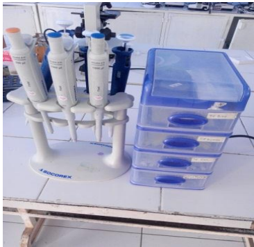
Klinipet dan Tip