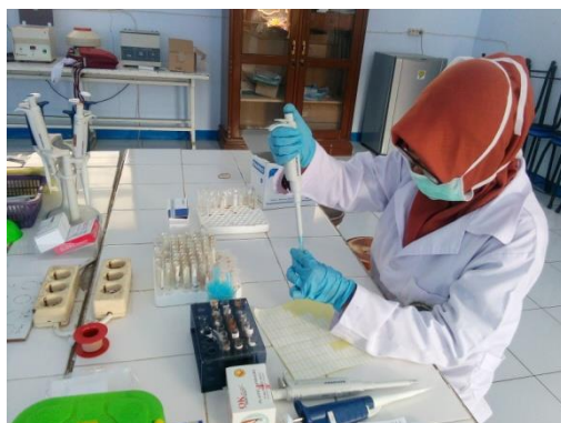
Pemipetan sampel dan reagen