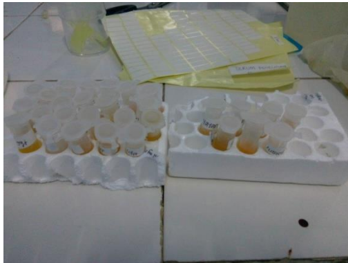
Serum darah pasien