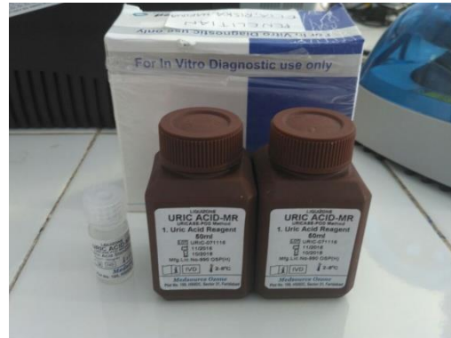
Reagen Asam Urat