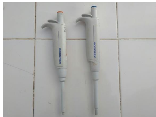
Clinipet 20 µl dan 1000 µl