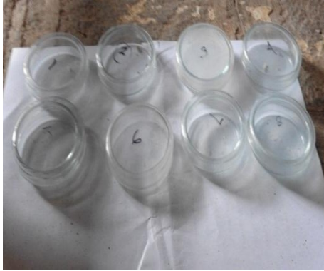
Sampel kerokan kulit